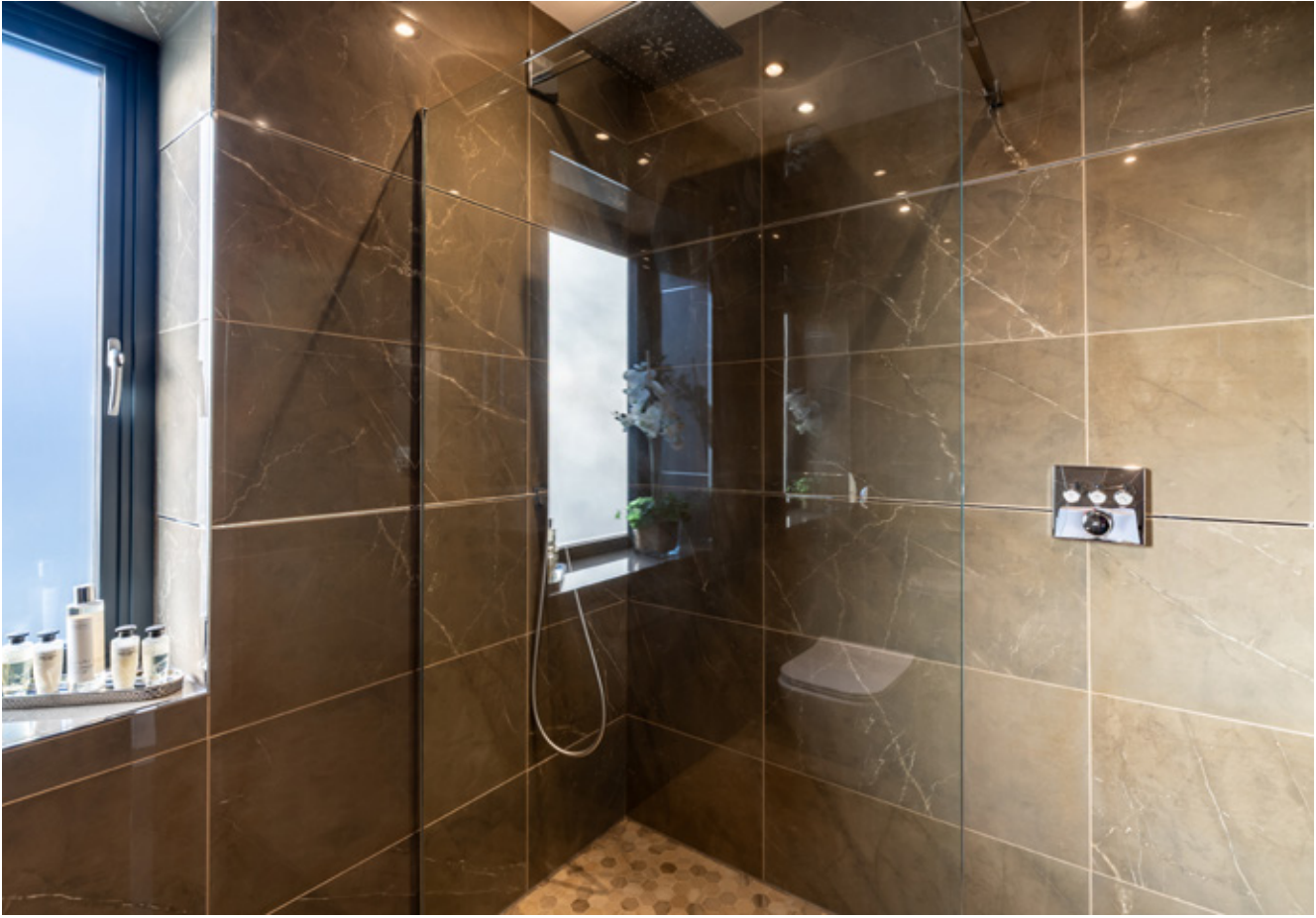
FAMILY SHOWER ROOM