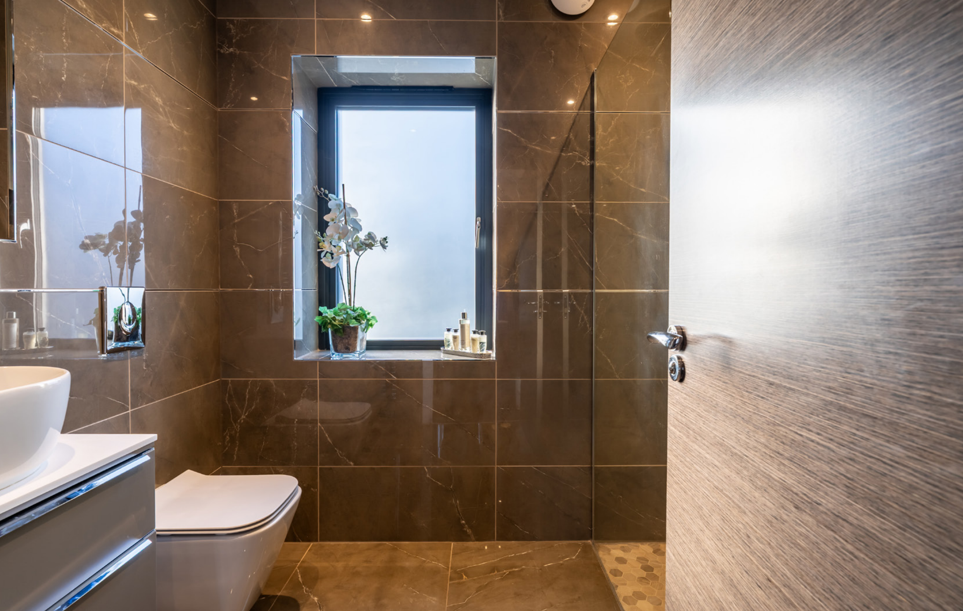
FAMILY SHOWER ROOM