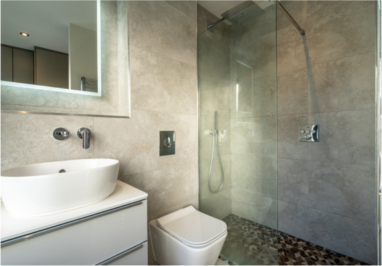
BEDROOM 2 EN-SUITE SHOWER ROOM